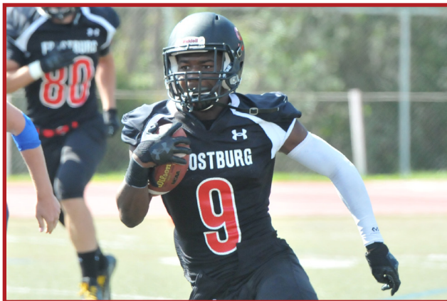
Frostburg travels to Rowan having won 12-straight games, including 10 straight in the NJAC